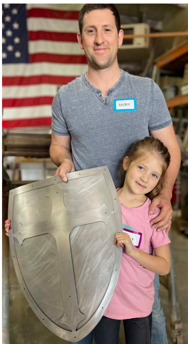
Shield Building at Valhalla's Forge in Virginia Beach