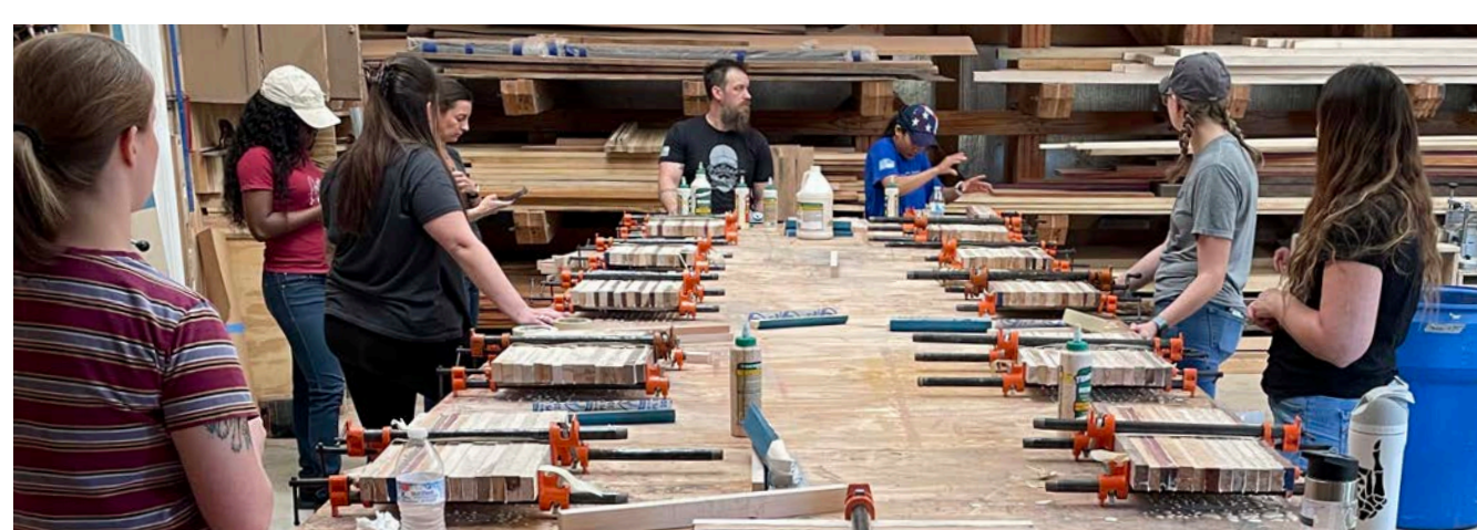
Woodworking at Ballash Woodworks, Fort Bragg