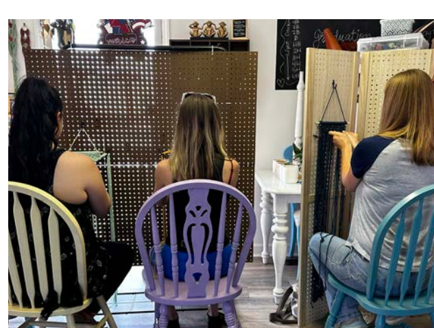
Mindfulness & Macrame Workshop, Camp Lejeune

ourStation experiences are carefully planned to reinforce the values and virtues of The Station Foundation®. Our facilitators and mentors tap into their creativity as they plan engaging events that share our curriculum in small, meaningful doses.